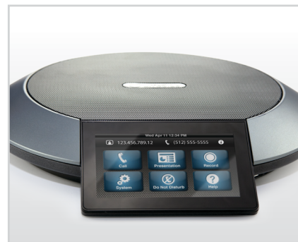
Includes LifeSize® Phone™