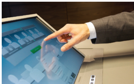
The revolutionary touch screen of TANDBERG telepresence makes initiating and managing a telepresence meeting even easier.

Bringing the benefits of Tandberg Total Telepresence to new ways of working.