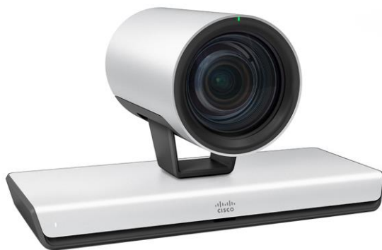
Figure 1. Cisco TelePresence Precision 60 Camera