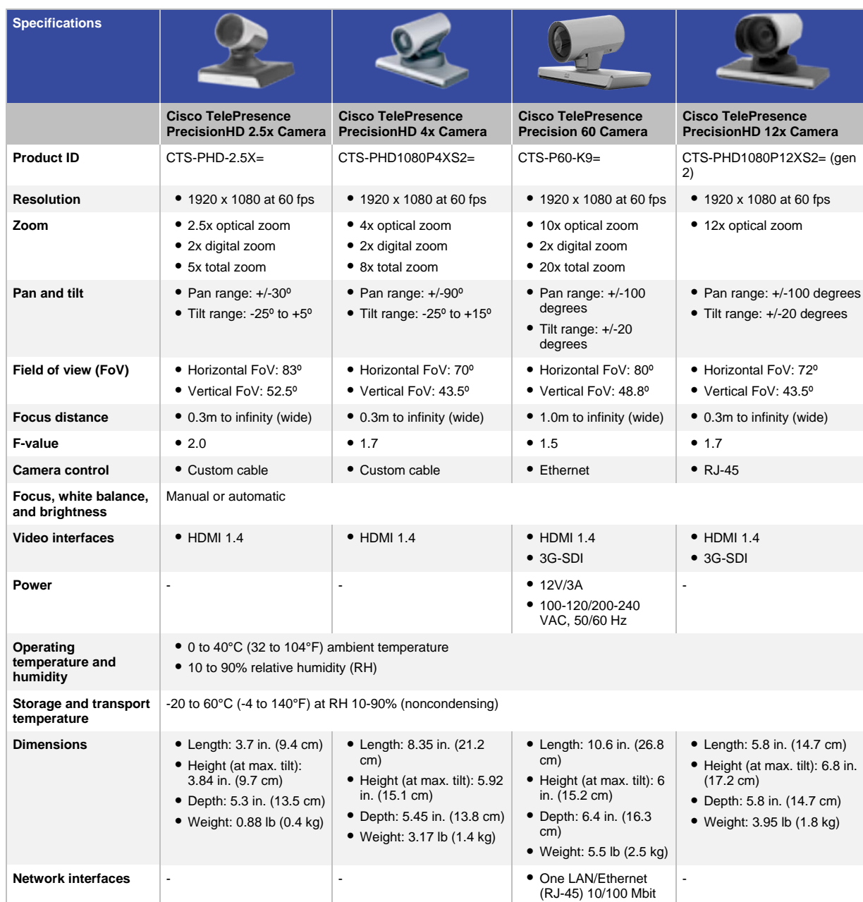
Table 1. Cisco TelePresence Precision Camera Features

Note: Product specifications are estimates and are subject to change without notice.