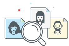
Centralised management & reporting

Indepth statistics from the administrator dashboard . Monitor call history, user statistics, add/remove users and manage passwords & PINs, and use reporting for ROI analysis and adoption.