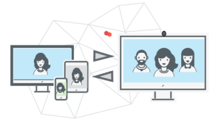
Any-to-any video dialing

Connect any device, inside or outside your company. Unlimited video minutes and 50 participants in one meeting. Easily connect different video platforms, endpoints & audio conferencing, all in the same meeting.