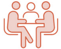
Microsoft in the Meeting Room

Devices for direct integration enable Microsoft to be deployed in the meeting room, huddle room, boardroom and executive suite. Enterprise-grade video, voice and collaboration experiences in every room. A range of solutions and technologies for both Skype for Business and Teams.