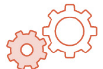
Security, network & design

Get your network backbone right with wireless audits, fibre broadband, SD-WAN and firewall management. Deploy Skype for Business with assistance from Microsoft Gold Certified solution architects, consultants, engineers and technicians.